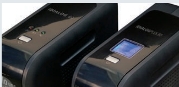
Particolare dei display